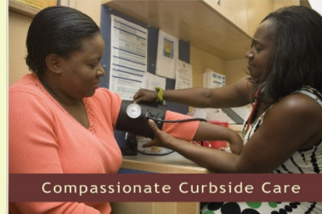
Compassionate Curbside Care

The Family Van is a mobile health care program designed to increase healthy life behaviors and improve access to health care. Our mission is educate, counsel and screen men, women and youth about their health. Secondly, and more importantly to assist them to proactively strengthening and protecting their bodies, minds, families and communities. As a vehicle-based community outreach program, the Family Van offers FREE, culturally and linguistically appropriate health education, medical screenings, and innovative special programs directly to Boston neighborhoods with the poorest health outcomes.